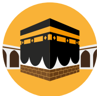
Hajj by Proxy

We can make arrangements to perform religious obligation or contribute to a charitable organisation on your behalf if you have suffered TPD or passed on. Please refer to the Frequently Asked Questions for further details.